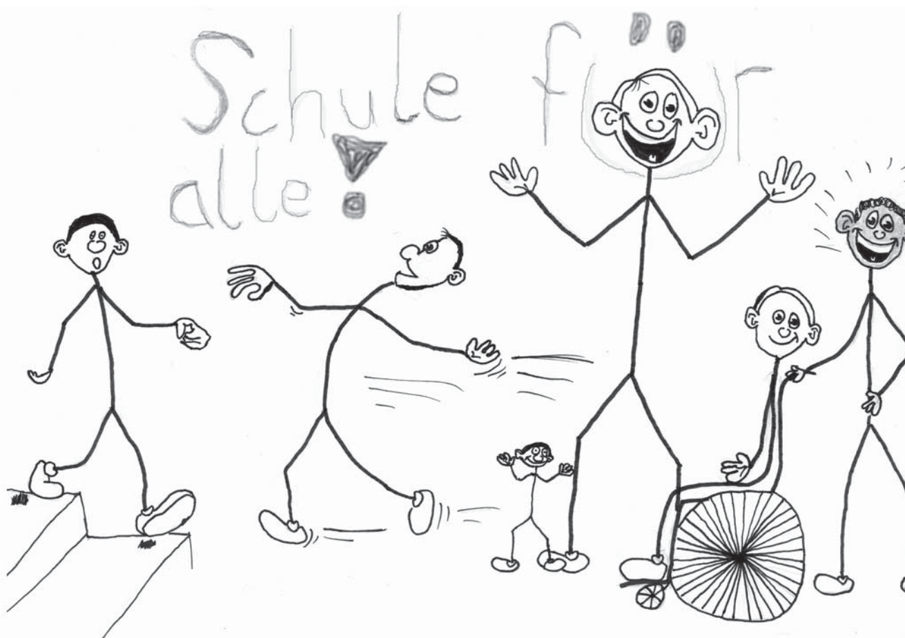
„Schule für alle“ aus der Sicht von Luka (11 Jahre).