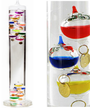
Figure 1. Galileo thermometer.

Each of the floating spheroids displaces a weight of fluid equal to its own weight, while the others either displace too much or too little liquid to float at a specific position within the cylinder. Such a statement derives from Archimedes' principle.