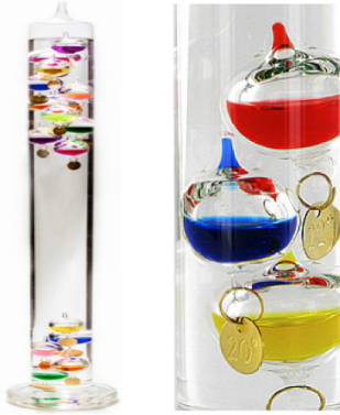
Figure 1. Galileo thermometer.

Each of the floating spheroids displaces a weight of fluid equal to its own weight, while the others either displace too much or too little liquid to float at a specific position within the cylinder. Such a statement derives from Archimedes' principle.