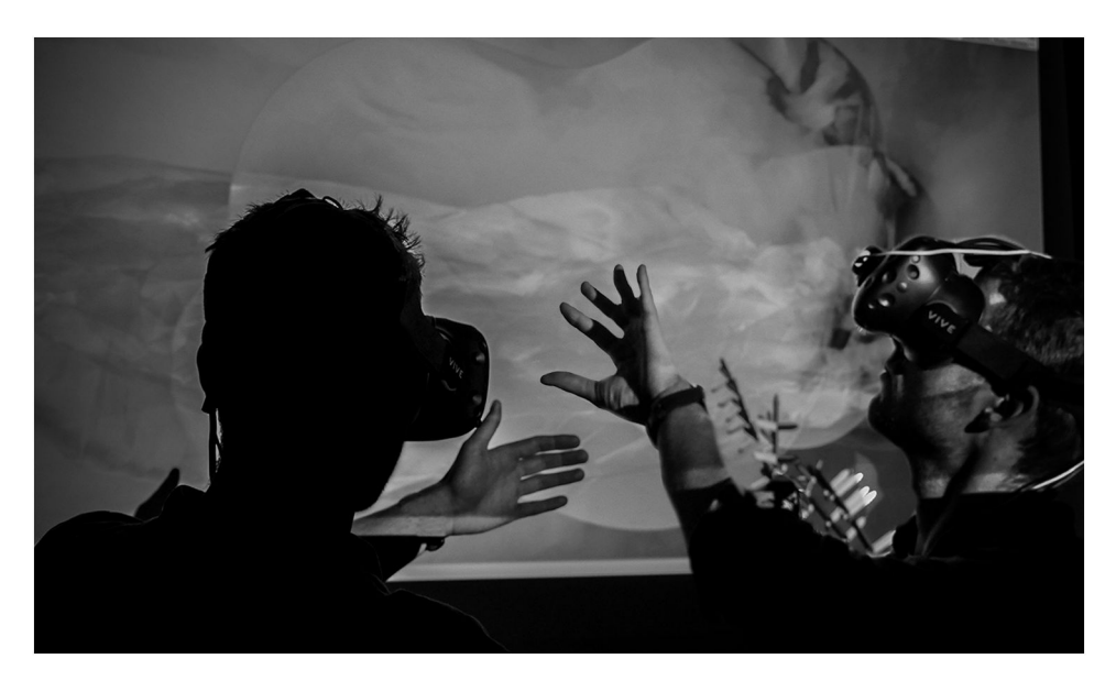
Figure 7: Project Deeter – a research project on the CVE 'The Virtual Meeting Room' by Constantin von der Mülbe, which has been supported by the Fellowship-project

In a cooperation of the project 'Industry 4.0' with the project "Deeter", led by Constantin von der Mülbe, collaborative modelling in virtual spaces is prototypically tested. This development and further use of the hardware, software and knowledge is highly appreciated and should be intensified.