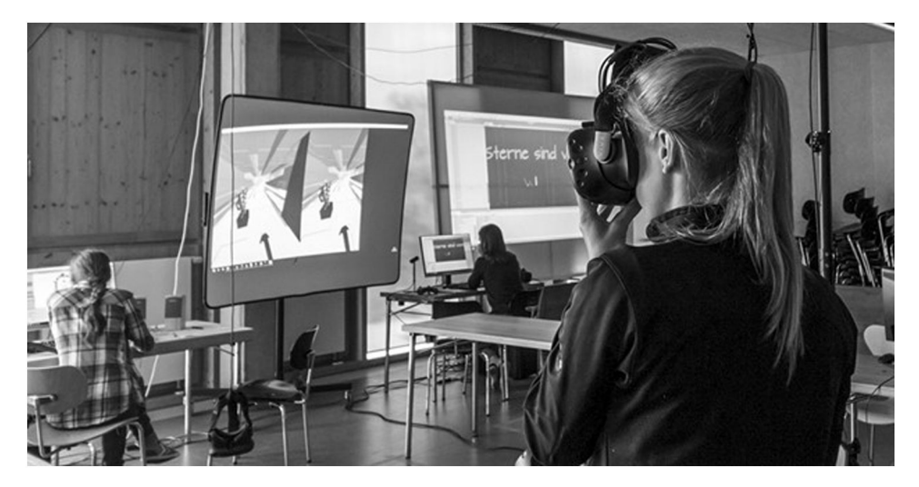
Figure 4: Testing of a virtual, immersive and interactive game environment which has been developed and programmed by architecture students of the Detmold School of Architecture and Interior Architecture

The workshop 'Maßlos Immersiv' focused on experimental "3D modeling" and "sketching" in virtual spaces. The aim was to explore new ways of cooperation, interaction and presentation in an immersive environment and to explore and convey the modelling process in a group work. Hereby students developed various spatial VR games in which the user had to solve certain tasks conceived in interaction with the room and individual objects. For the individual projects the student teams made use of a variety of VR- and AR-Equipment (HTC Vive/Oculus Rift/ Microsoft Hololens etc). Depending on the group and the objectives of the respective group work, different software platforms such as Rhino, Unreal, Unity3D, Virtual Sketching (RWTH) and e.g. Tilt Brush have been used for the project.