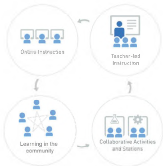
Image adapted from the Blended Learning Universe (BLU_) (Clayton Christensen Institute, 2024)